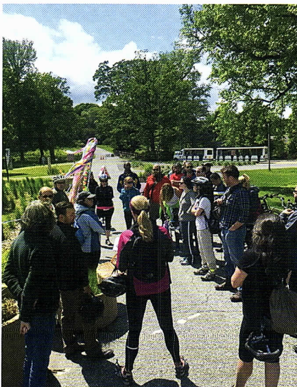
“Petal” to the Parks riders gather to enjoy the ‘Grass Roots’ exhibit. ‘Grass Roots’