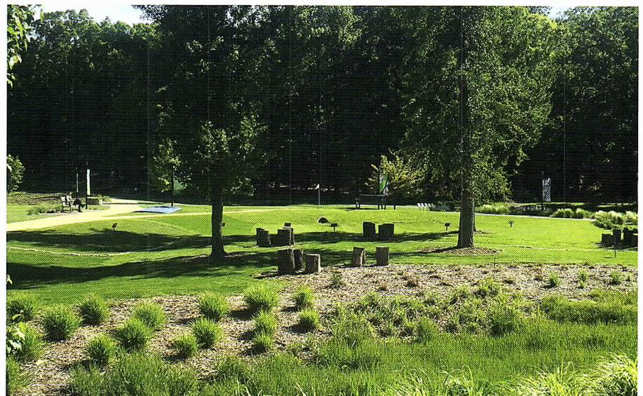
The ‘Grass Roots’ exhibit entices visitor to learn as they explore and enjoy the green oasis of turf. Photo by Geoffrey Rinehart, ‘Grass Roots’